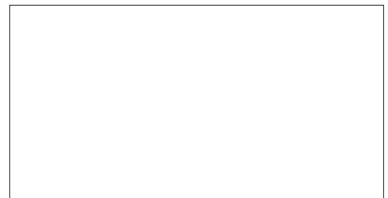
Shutter door Family