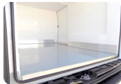
Pallet-stackable floor and wheel well protection