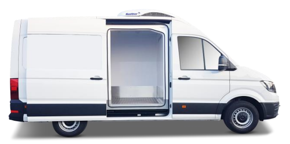
Insulated sliding side door