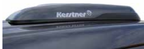
Extra-flat Kerstner® refrigeration unit