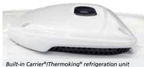
Built-in Carrier®/Thermoking® refrigeration unit