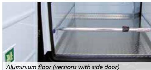
Aluminium floor (versions with side door)