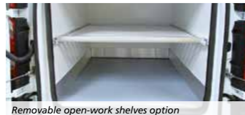
Removable open-work shelves option