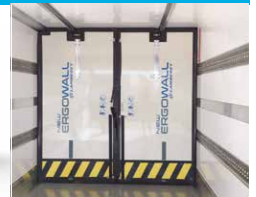
Ergowall, winner of the Trailer Innovation Award: ultra-light bulkheads with enhanced sliding and lifting assistance.