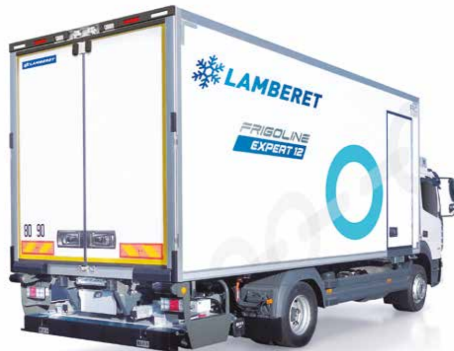
The integrated door handles are a signature of the Frigoline Expert 12.

The newly introduced FRIGOLINE Expert 12 body is the first refrigerated box entirely designed for the 7 to 12-ton truck segment. With its recognized expertise in the field of conversions dedicated to city center fresh-food deliveries, LAMBERET has developed specifications devoted to this business. Frigoline Expert 12 offers a competitive advantage in terms of design, robustness, insulation, lightness and ergonomics. Its range of sizes and rear opening solutions take into account modern food containers size and last mile delivery habits. ■