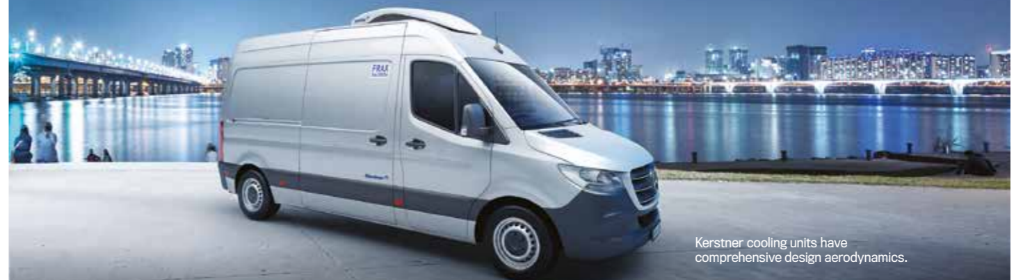
Kerstner cooling units have comprehensive design aerodynamics.

Kerstner's strength is in offering an insulation and refrigeration unit conversion under its unique brand. This pairing, perfectly adapted and opti-