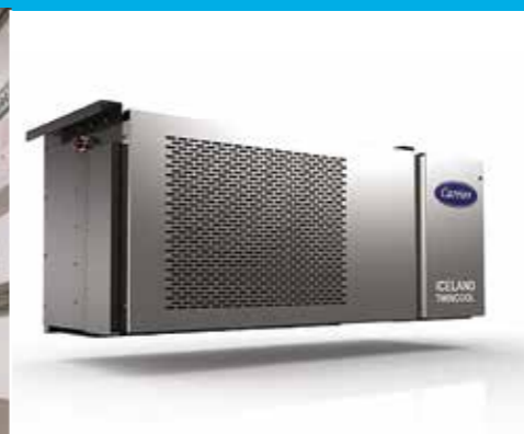
Bi-temperature Carrier Iceland Twin-Cool Cooling Unit with single and dual-flow evaporators LL3/LL2D.