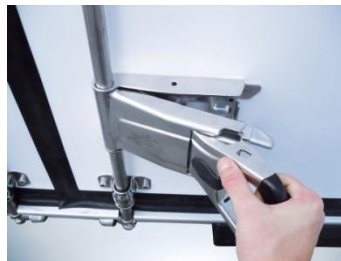
1-motion "easy" handle