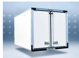
OT2 option, bolted rear frame