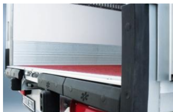
On OT/Pro Package: reinforced stops